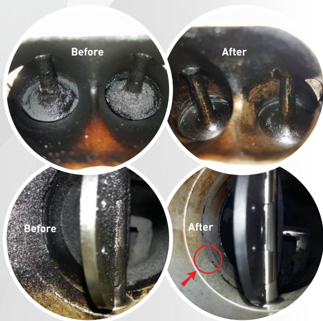
Close-up of the intake valves (at top) and the intake pipe flap (bottom).

The resulting problems are wide and varied - from a thoroughly contaminated intake area through a faulty exhaust gas recirculation valve and poorly closing intake valves as well as the associated loss of compression to engine damage.